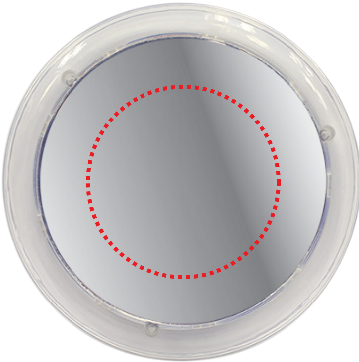
2" DIAMETER LABEL